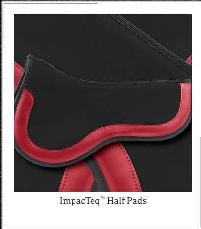
Impacteq™ Half Pads